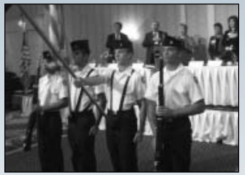
"Dynamic speakers." Absolutely fabulous."

On program evaluations, attendees comment on the faculty members' effectiveness and quality