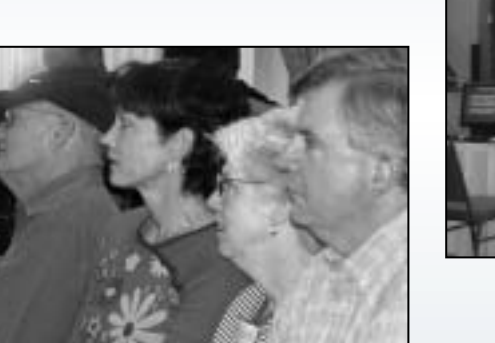
"The program topics were appropriate and timely."